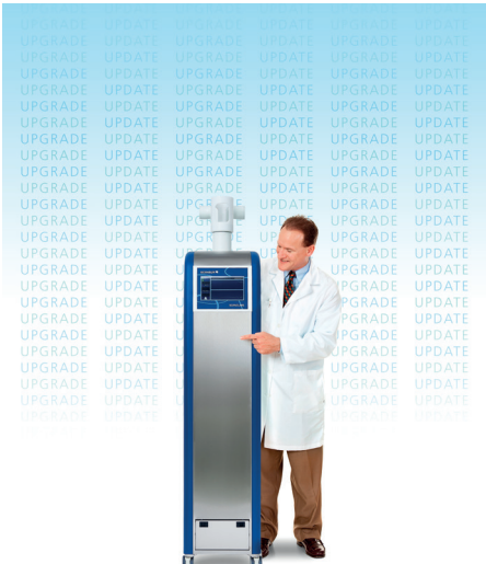
ScanClime: The smart way to modernise your facility Page 10