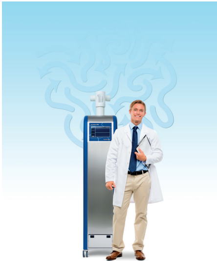
ScanClime: Planning made easy Page 4