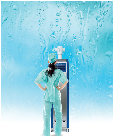
ScanClime: Take control of humidity Page 6