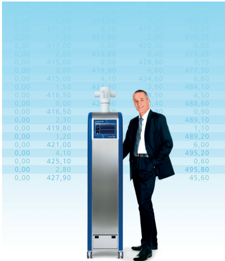
ScanClime: Strong finances, fast payback Page 8