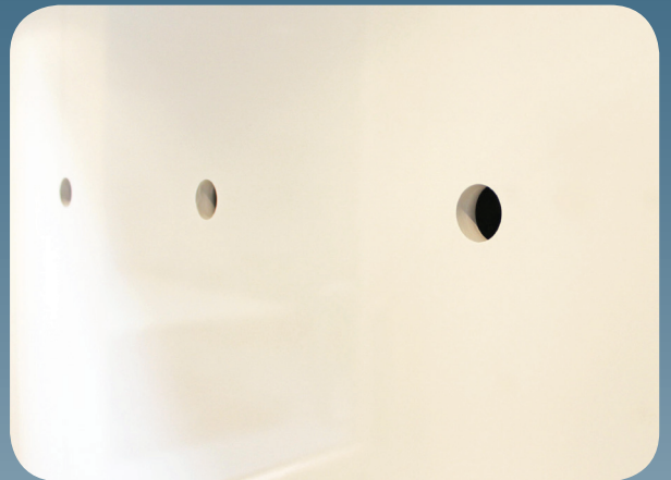
The air leaving the 30 nozzles with a diameter of 38 mm, has a velocity in excess of 100 km/h