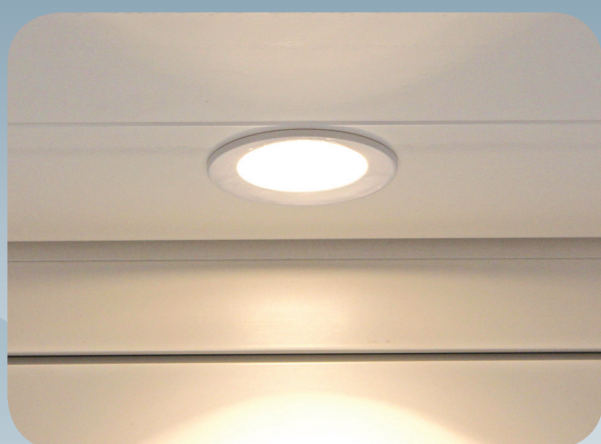
Spotlight inside the cabin