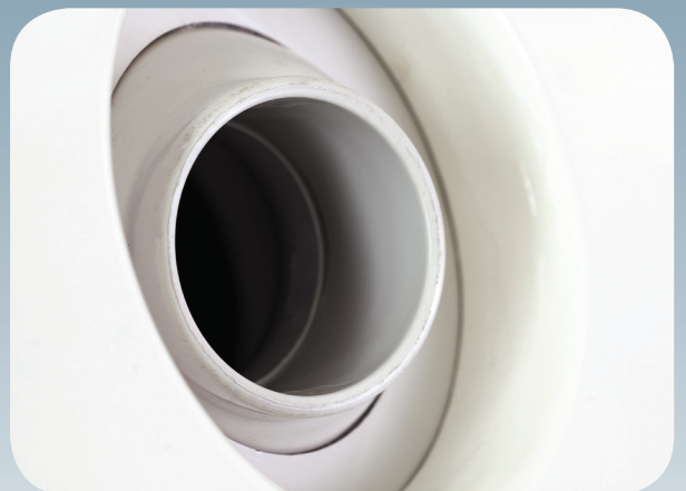
The movable nozzles (optional) ensure the correct direction of the airflow