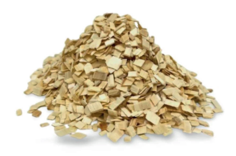
Classic 10 kg