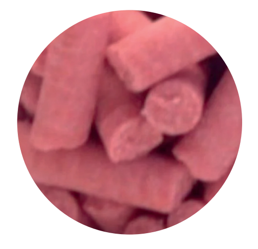
Ssniff Primate, vegetarian, ex. fruits Diet Available in DENMARK, SWEDEN, NORWAY, FINLAND 12,5 kg box.

This purified diet of the DIO series is one of three control diets with low fat and energy contents. The sucrose content of this diet has been further reduced 1% in total.