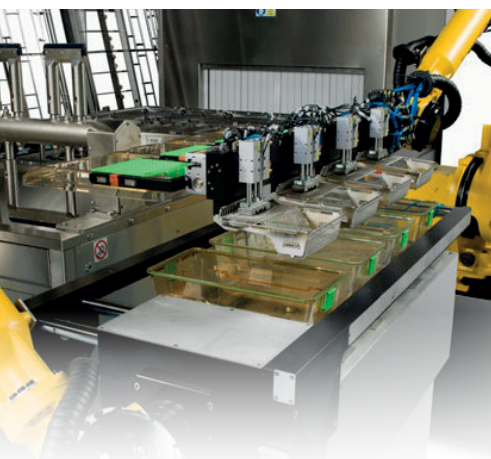
Productivity & Capacity