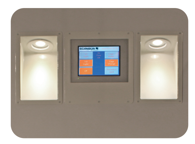
Touch panel in colour with integrated dispenser control. Optional: Spotlights.

The ScanFlow has been validated on allergens and particles. The test on allergens showed that the cabin will reduce the allergen exposure by 90% and by following the right SOP, all allergens will be removed from the breathing zone. Test on particles shows clean room class 1 at the working table and in the stack of clean cages.