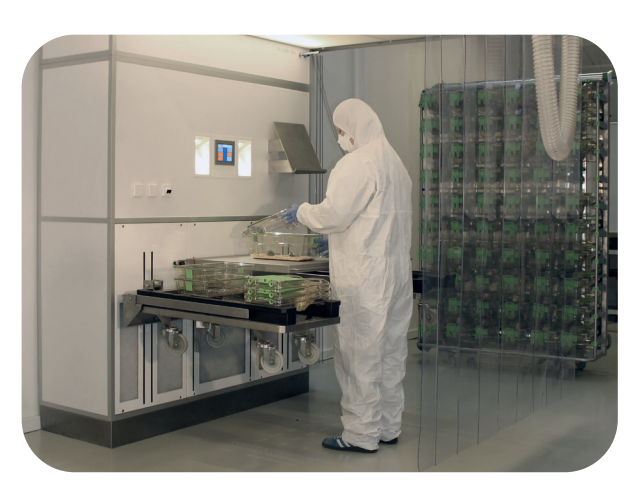
Operator: Full protection within the entire workzone. The cabin provides spacious working conditions.