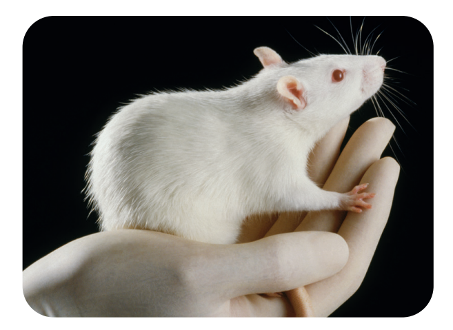
Animals and cage handling within a sterile area.