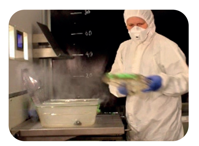
Environment: The downflow and inflow ensure that no allergens nor pathogens leave the cabin (this image was taken during a smoke test).