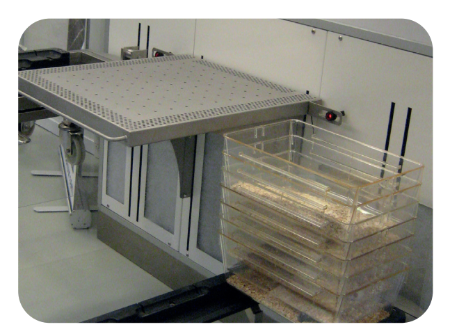
Optional: Automatic dispensers on each side of the height adjustable, perforated table.