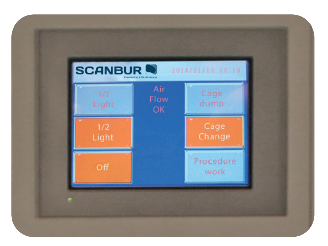
Choose between 3 programmes.